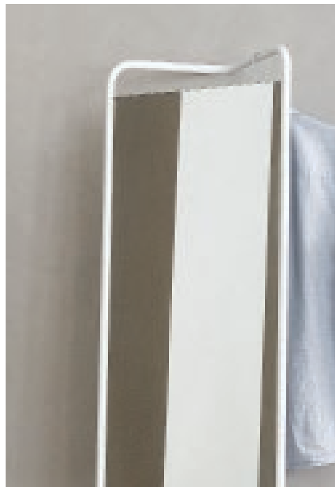
KaschKasch Floor Mirror, White, by KaschKasch

Glass mirror with three-dimensional powder coated steel triangular frame.